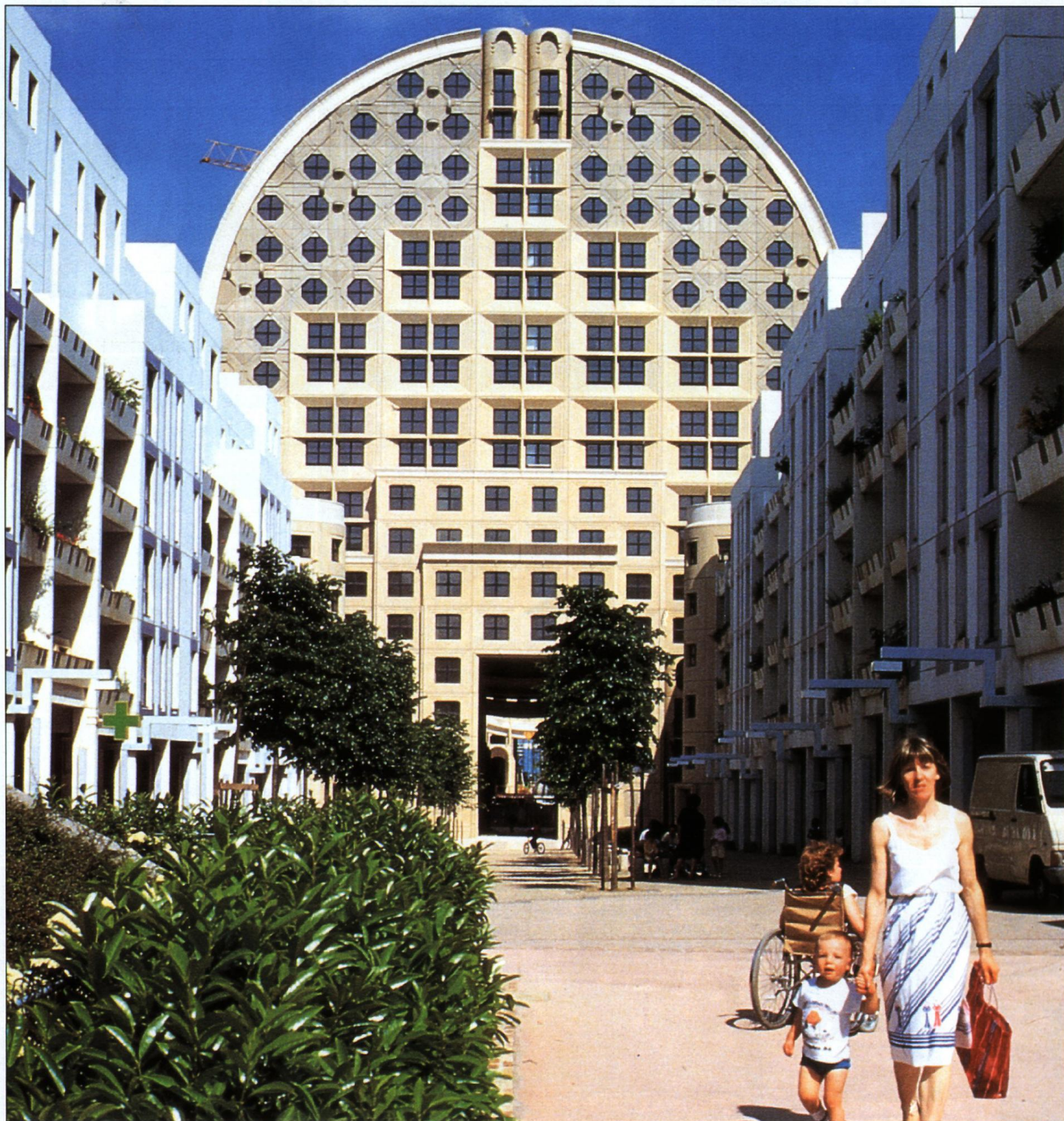
The Pablo Picasso Place in Noisy-le-Grand, near Paris, France – one of the first projects to be completely prefabricated architecturally.